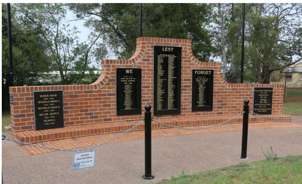
Alstonville War Memorial