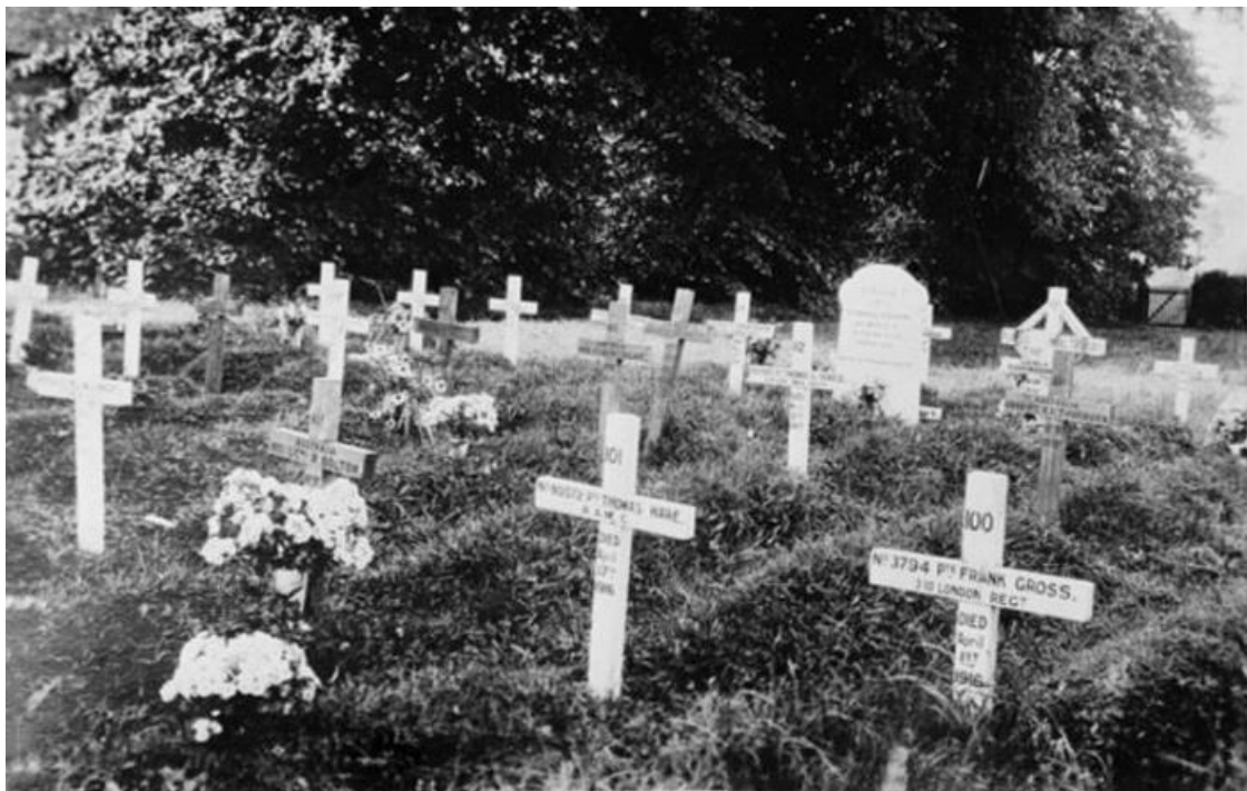
Original Grave Markers in Churchyard at Stratford-sub-Castle