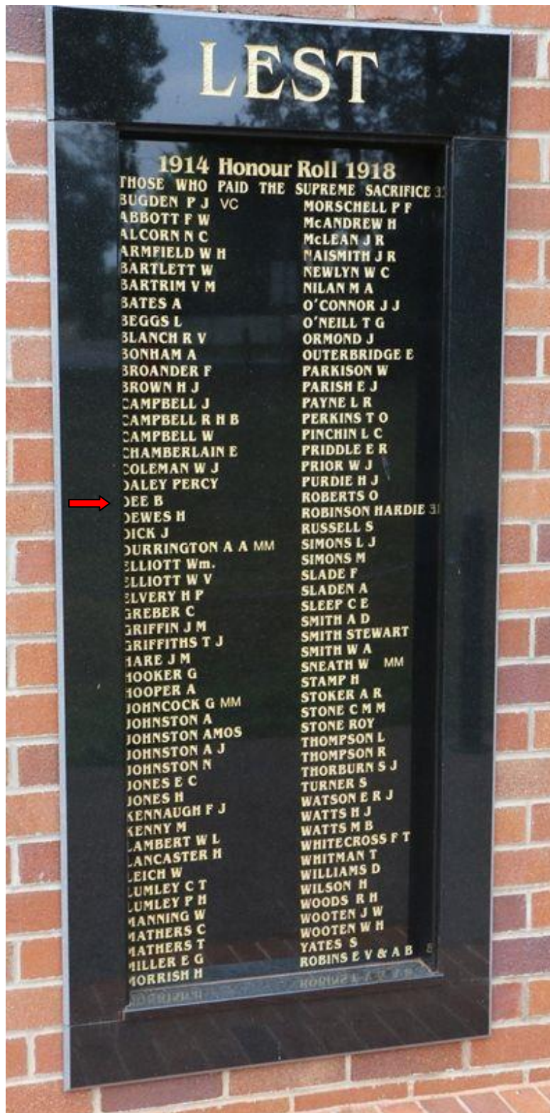
Alstonville War Memorial